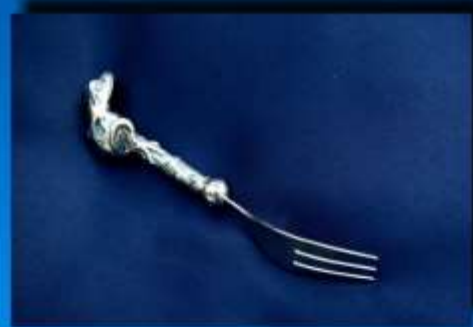
FROG CAKE FORK CF 004