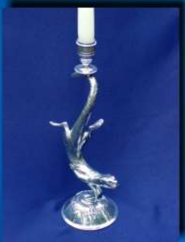
OTTER CANDLEHOLDER CH 008