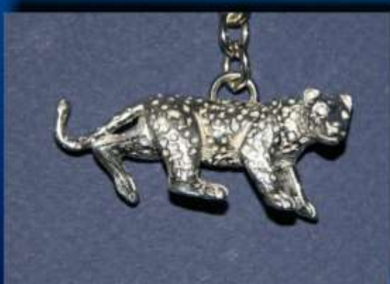
LEOPARD KR 004