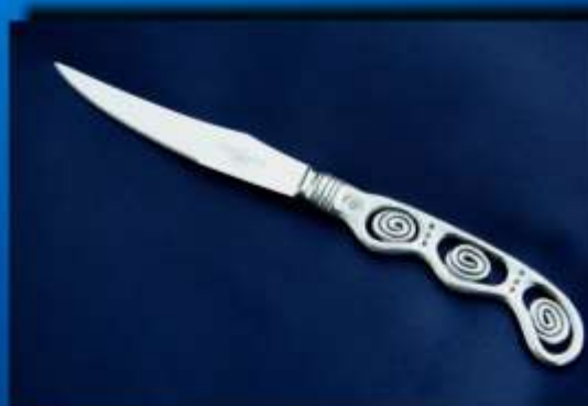
STEAK KNIFE ZR011