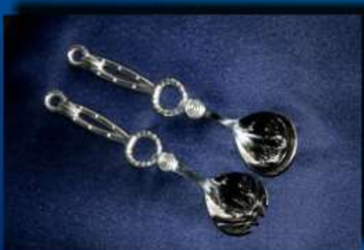
SALAD SERVERS ZR 004