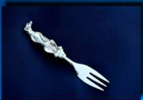
MEERKAT CAKE FORK CF 003