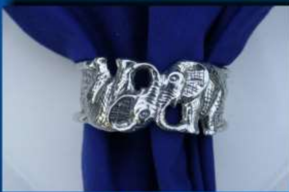
ELEPHANT NR 010