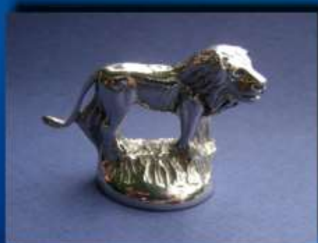
LION MIN 005