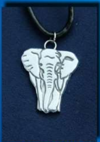
FLAT ELEPHANT PENDANT NE 003