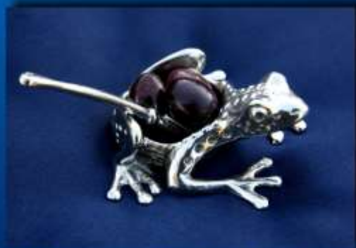
FROG CONDIMENT DISH & SPOON MC 010