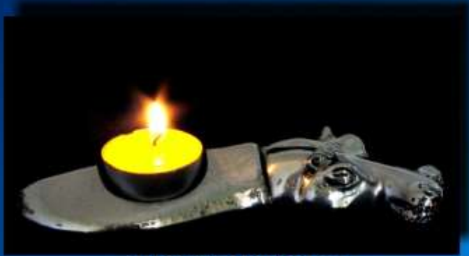
HIPPO TEA LIGHT CH 006