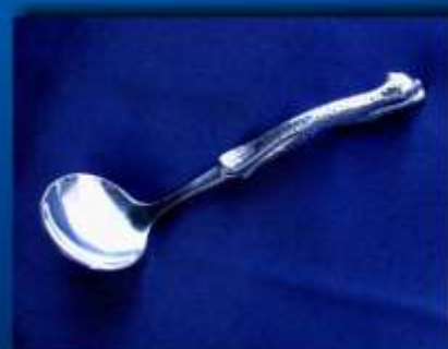
LEOPARD SUGAR LADLE S 006