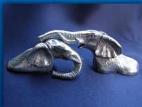
BACHELOR BULL ELEPHANTS ES 005