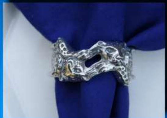
LEOPARD NR 009