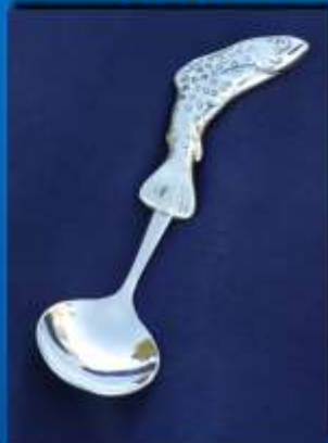
TROUT SUGAR LADLE S 002