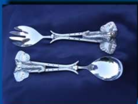
ELEPHANT SALAD SERVERS SS 004