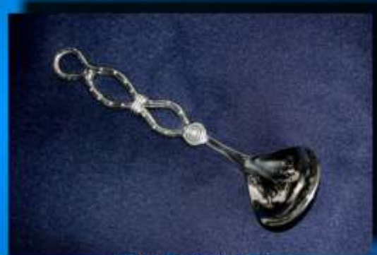
SERVING SPOON ZR 003