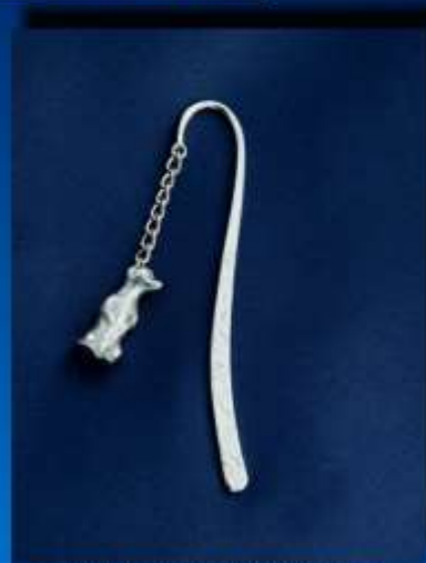
MEERKAT BOOKMARKER BMH 002