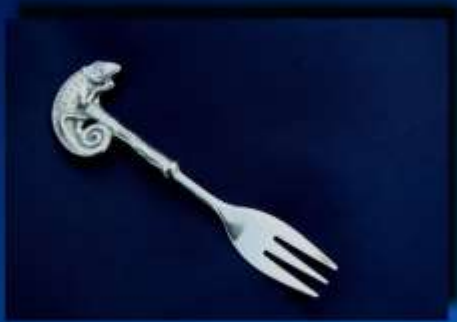
CHAMELEON CAKE FORK CF 001