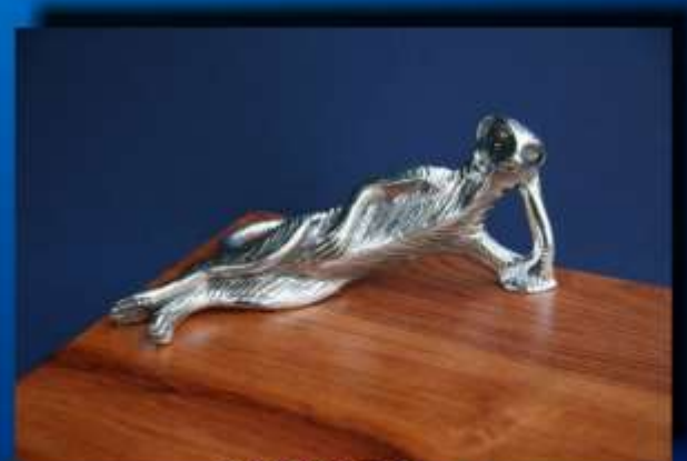
MEERKAT BCH 004