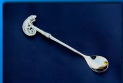
CHAMELEON SUNDAE SPOON SP 009