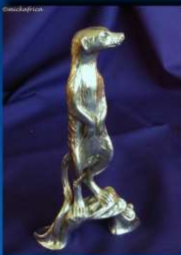
SENTRY MEERCAT MS 001