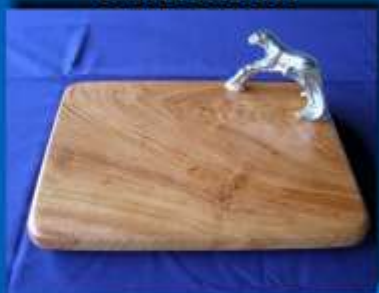
LEOPARD CHEESE BOARD RECT. BOD 009