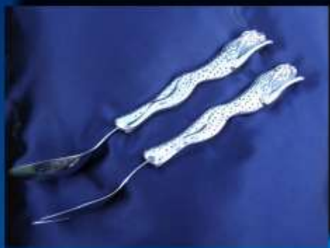
CHEETAH SALAD SERVERS SS 001