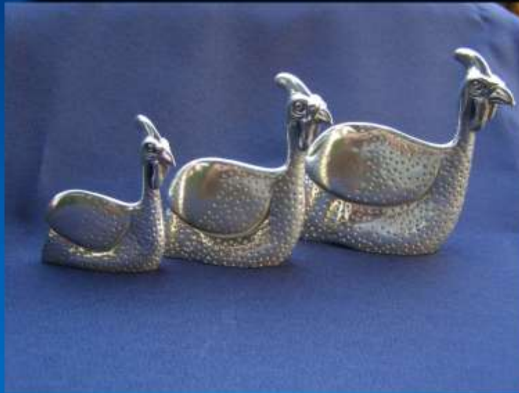
GUINEA FOWL (S) Gf003 (M)002(L)GF001