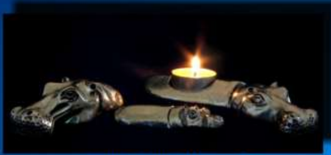
HIPPO (L) PW 001 (M) PW 002 (S) PW 003