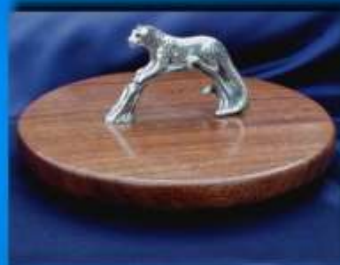
LEOPARD CHEESE BOARD ROUND 26CM BOD 005 30CM BOD 008