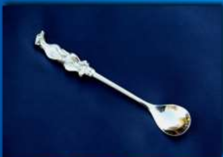
MEERKAT SUNDAE SPOON SP 008