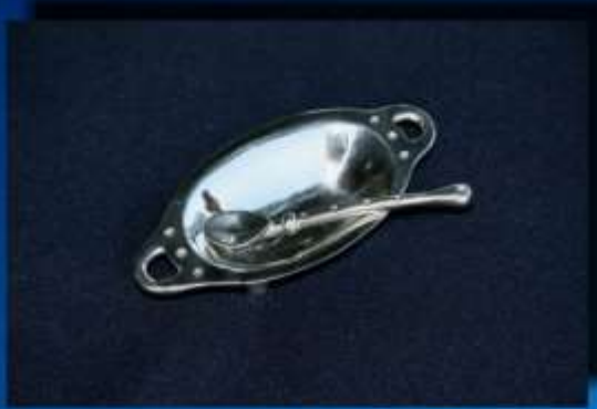
CONDIMENT DISH & SPOON ZR 001