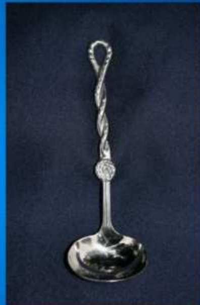
SAUCE LADLE ZR 008