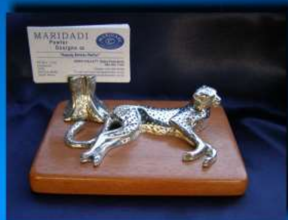
CHEETAH BCH 002