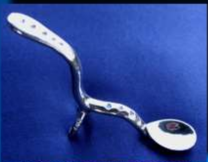
3 LEGGED CONDIMENT SPOON SP 002