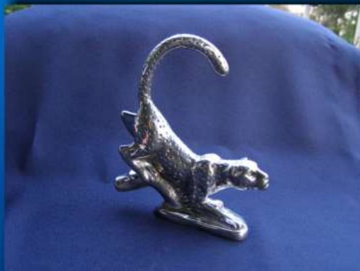
LEOPARD LS 001