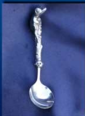
TREE FROG SUGAR LADLE S 005