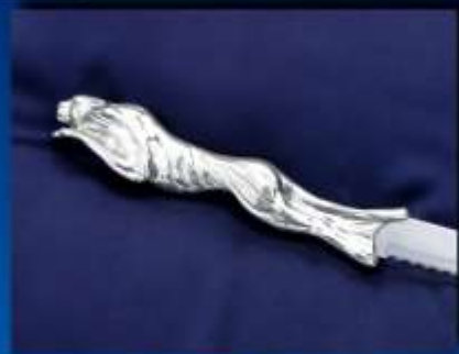
CHEETAH BK 002