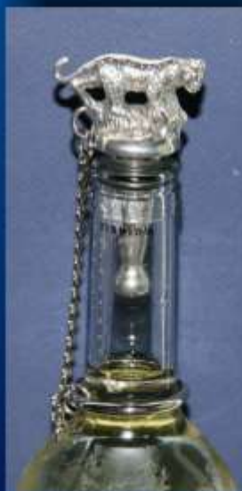
LEOPARD WS 013