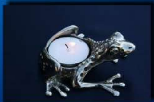
FROG TEA LIGHT CH013