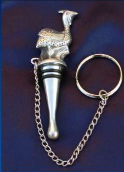
GUINEA FOWL WS 001