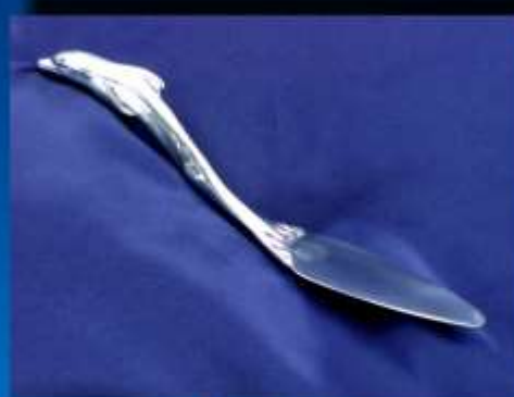
DOLPHIN CSL 002