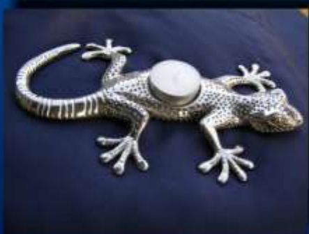
GECKO TEALIGHT CH 011