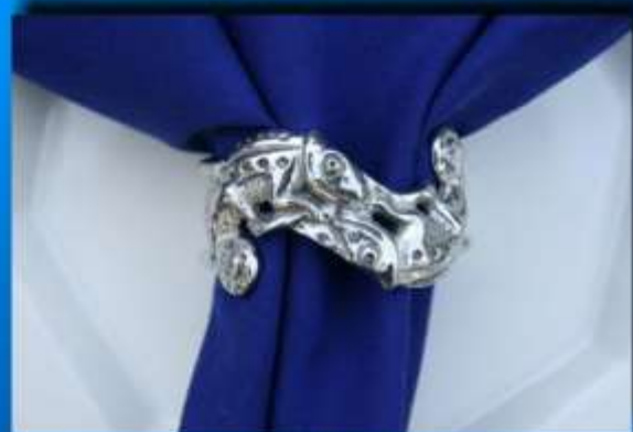
CHAMELEON NR 011