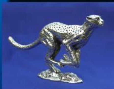
RUNNING CHEETAH PS 003