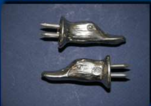
MEALIE COB HOLDERS MC 008