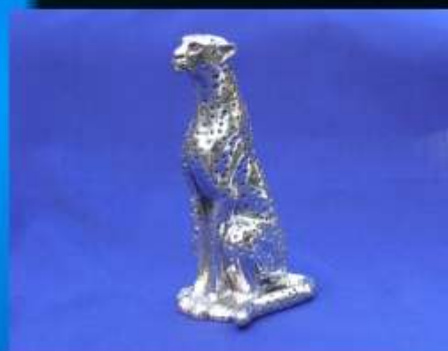
SITTING CHEETAH PS 002