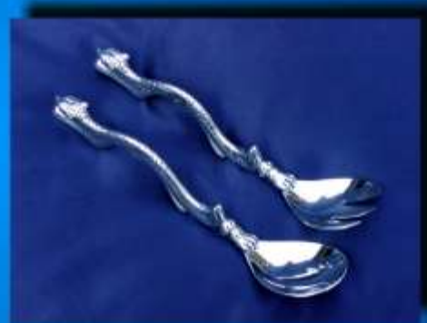
LEOPARD SALAD SERVERS SS 003 (small)