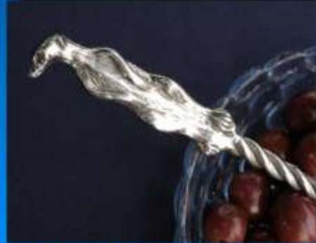
MEERKAT OLIVE SPOON SP 003