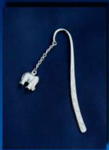
ELEPHANT BOOKMARKER BMH 001