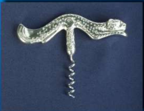
LEOPARD CS 003