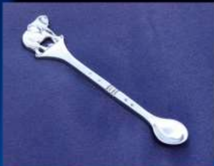
ELEPHANT MUSTARD SPOON MC 002