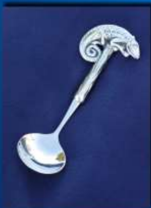
CHAMELEON SUGAR LADLE S 001