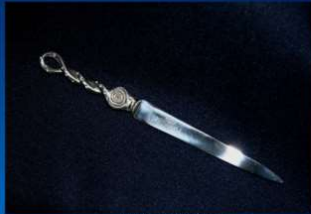
LETTER OPENER ZR 006