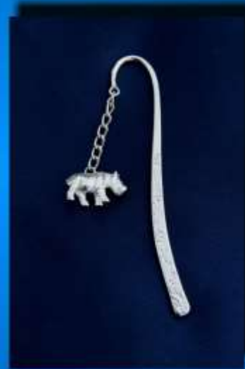
RHINO BOOKMARKER BMH 004