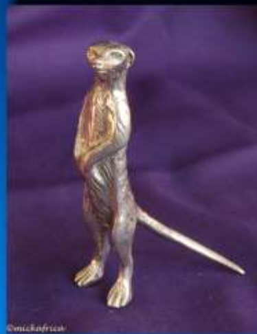
MOTHER MEERCAT MS002