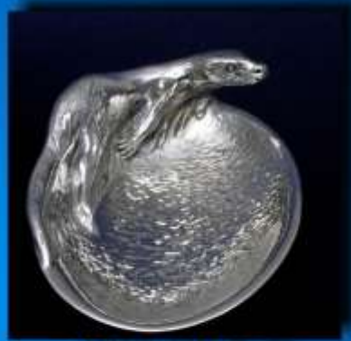
OTTER DISH MC 003