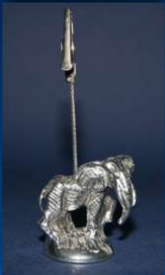
ELEPHANT PCH 001