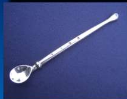
AFRICAN CONDIMENT SPOON SP 001