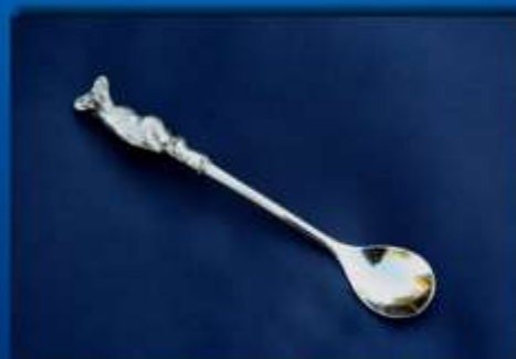
BUSHBABY SUNDAE SPOON SP 009