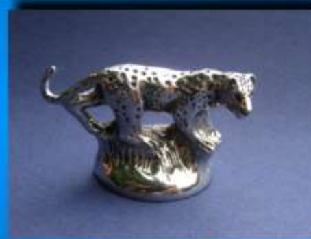
LEOPARD MIN 004