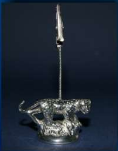
LEOPARD PCH 004