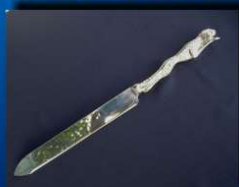
CHEETAH BRIDAL KNIFE WK 001