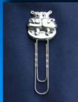
HIPPO BOOK MARKER BM 002