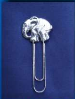
ELEPHANT BOOK MARKER BM 003