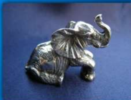
SITTING BABY ELEPHANT ES 004