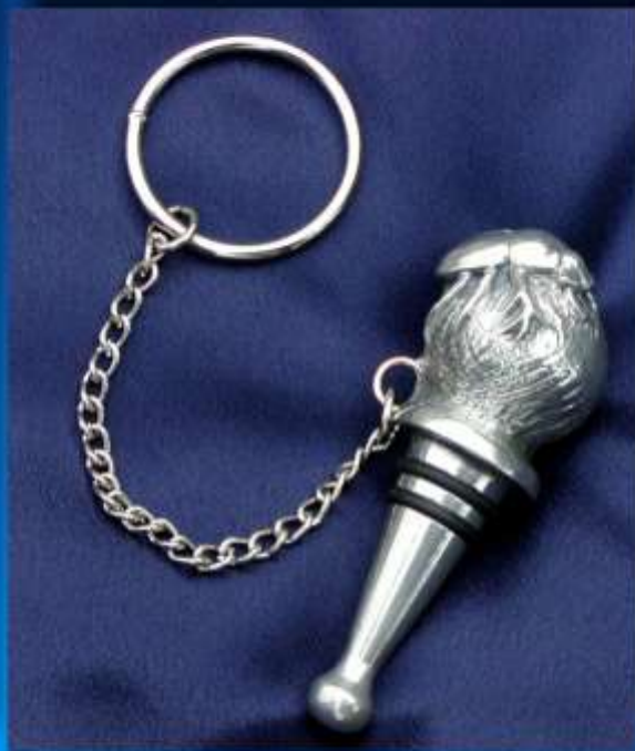
DUNG BEETLE WS 002