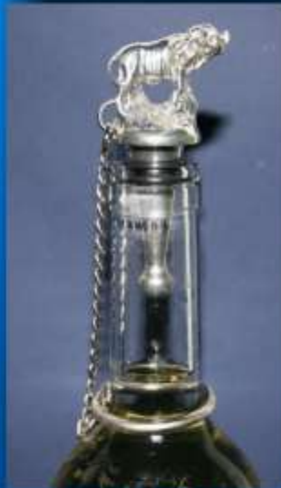
BUFFALO WS 012