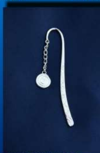
NDORO BOOKMARKER BMH 005