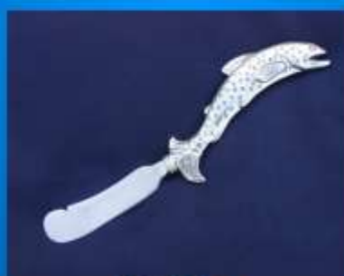
TROUT PK 002