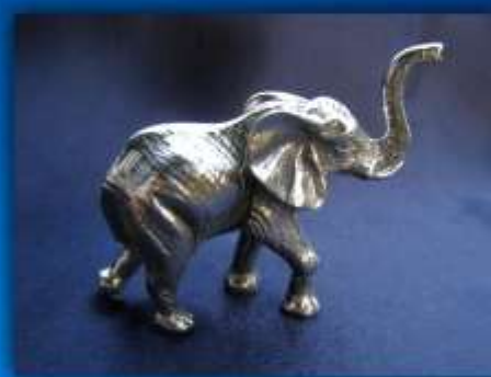
YOUNG BULL ELEPHANT TRUNK UP ES 002