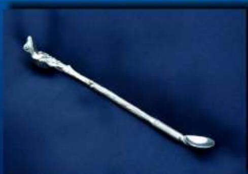
FROG COCKTAIL SPOON SP 006