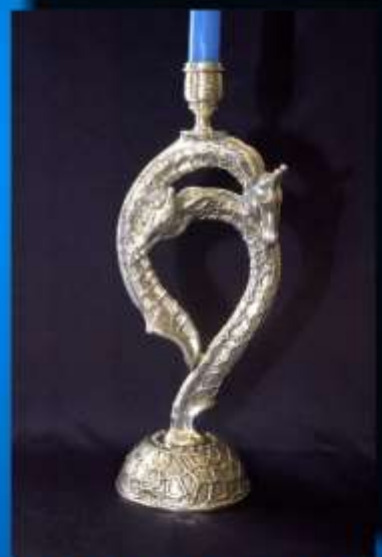
GIRAFFE CANDLEHOLDER CH 009