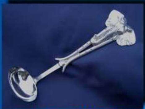
ELEPHANT SOUP LADLE SL 001