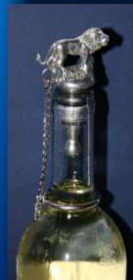
LION WS 014