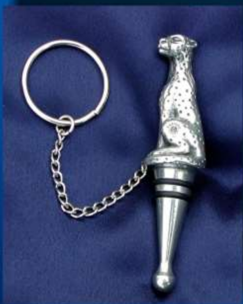
CHEETAH WS 003