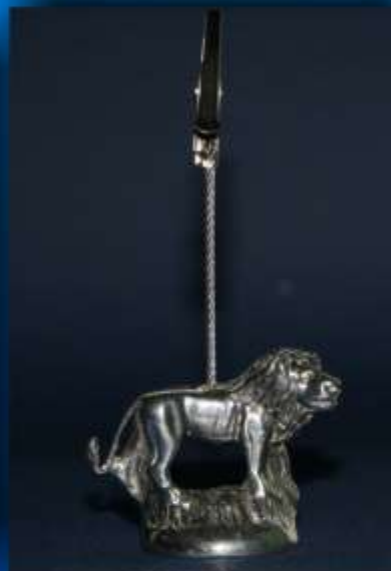
LION PCH 005