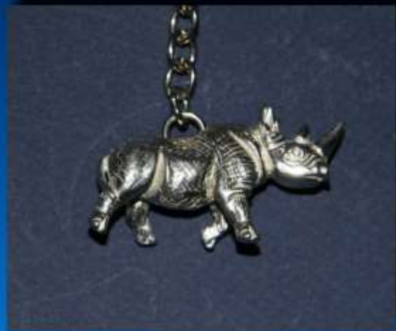
RHINO KR 002