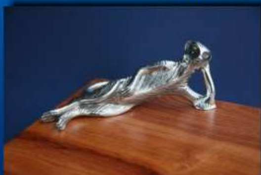
RECLINING MEERCAT MS 005