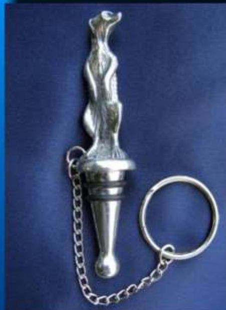
MEERKAT WS 005