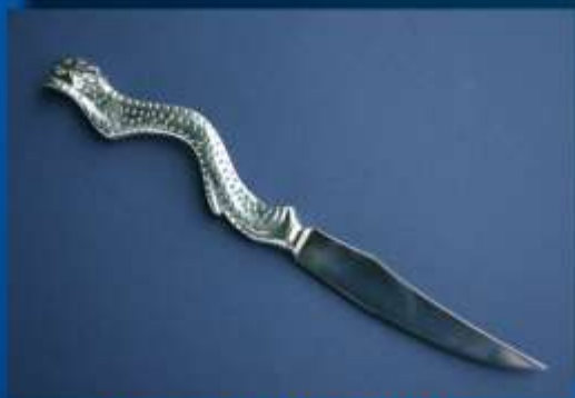
LEOPARD STEAK KNIFE SK001