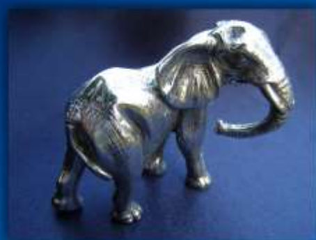
MATRIARCH ELEPHANT ES 001