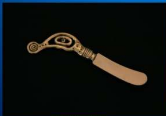
PATE KNIFE ZR 009