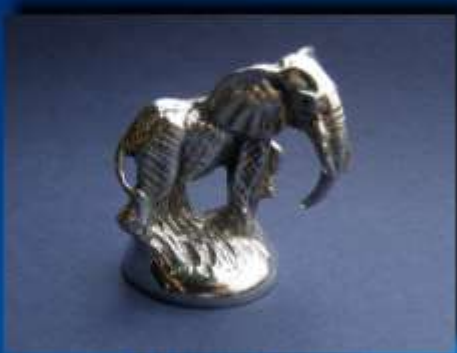
ELEPHANT MIN 001