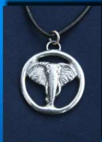
ROUND ELEPHANT PENDANT NE 004