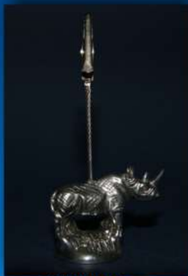
RHINO PCH 002