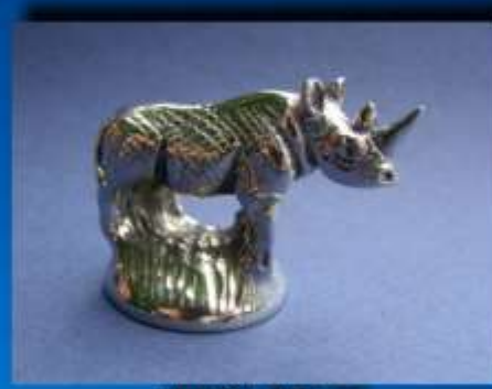
RHINO MIN 002