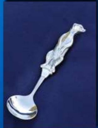
MEERKAT SUGAR LADLE S 004