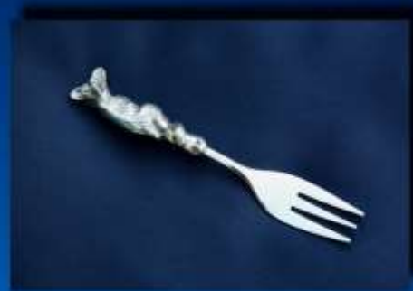
BUSHBABY CAKE FORK CF 002