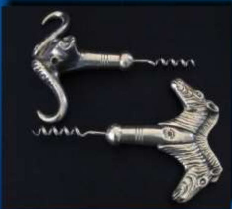
BUFFALO CS 002