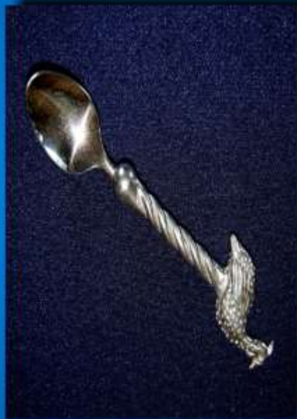
GUINEAFOWL TEASPOON TS003