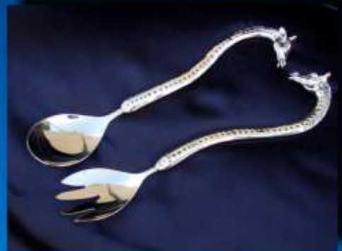
GIRAFFE SALAD SERVERS SS 002