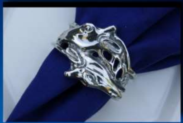
GIRAFFE NR 007