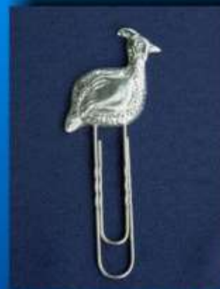
GUINEA FOWL BOOK MARKER BM 004