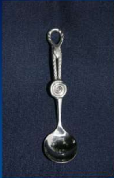
SUGAR LADLE ZR 005