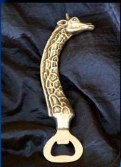
GIRAFFE BO 001