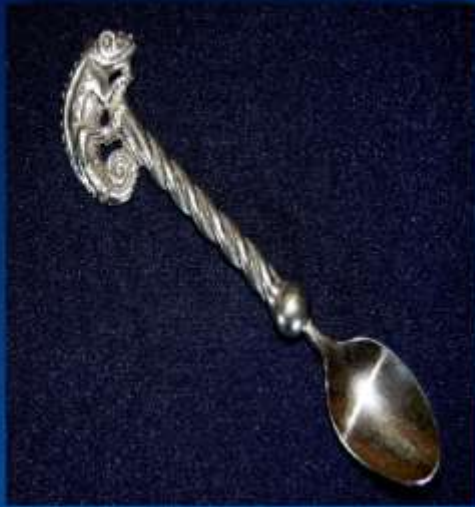
CHAMELEON TEASPOON TS002