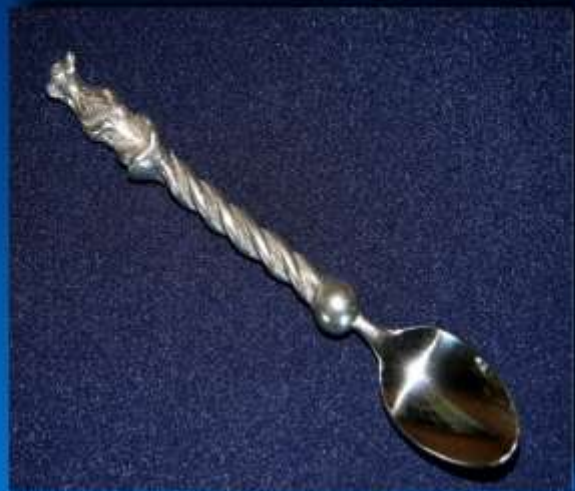
MEERCAT TEASPOON TS001