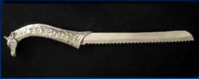
GIRAFFE BK 001