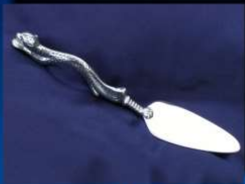
LEOPARD CSL 001