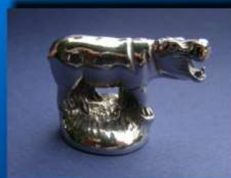
HIPPO MIN 006