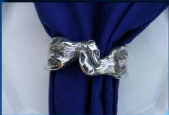
MEERKAT NR 008