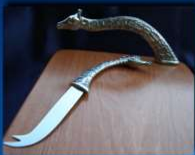
GIRAFFE CHEESE BOARD BOD 002