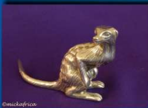
BABY MEERCAT MS 003