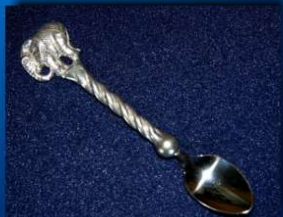
ELEPHANT TEASPOON TS004