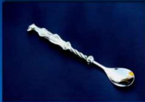
MEERKAT JAM SPOON SP 007