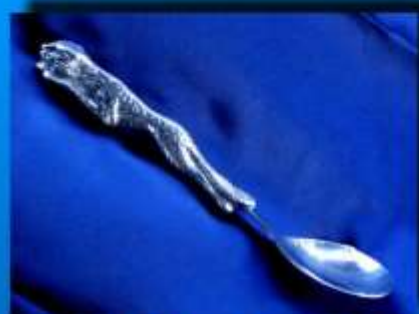
LEOPARD SERVING SPOON SP 005