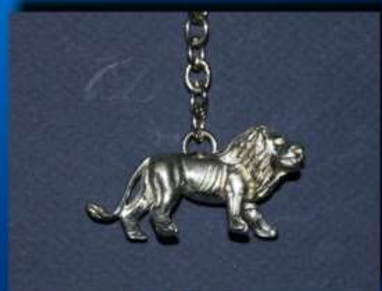
LION KR 005