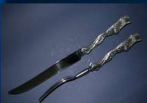
CHEETAH CARVING SET CSK 001