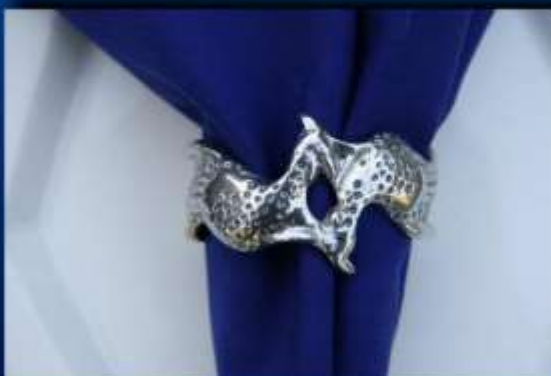
GUINEA FOWL NR 012