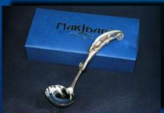
CHAMELEON SGL 001