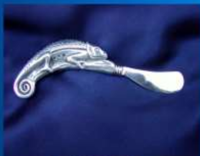
CHAMELEON PK 001