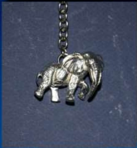
ELEPHANT KR 001