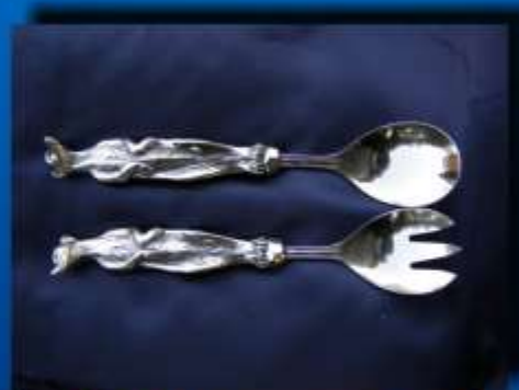
MEERKAT SALAD SERVERS (small) SS 001