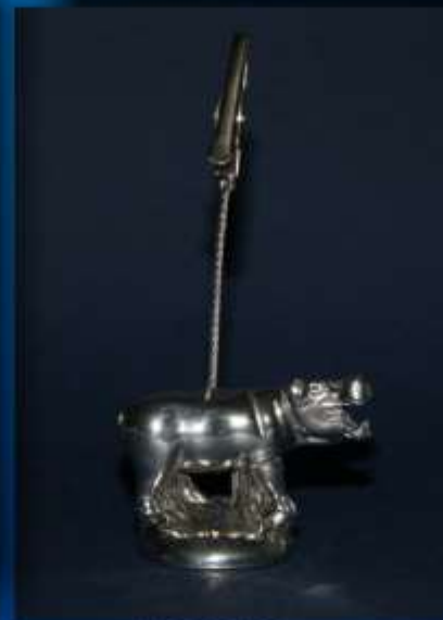
HIPPO PCH 006