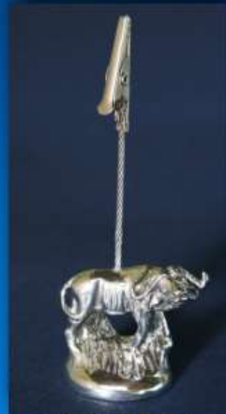
BUFFALO PCH 003