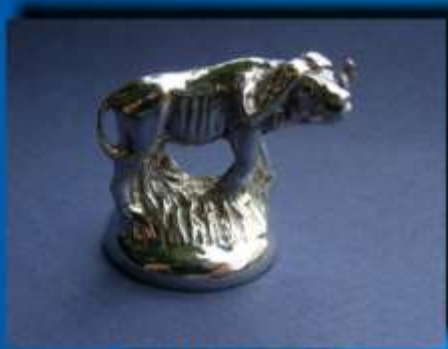
BUFFALO MIN 003