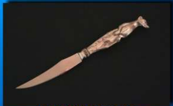
MEERKAT STEAK KNIFE SK 002