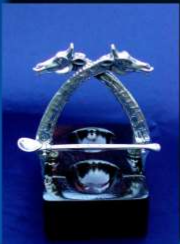
GIRAFFE SALT & PEPPER SET MC 005