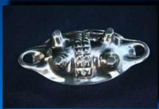
CONDIMENT DISH & SPOON UNDERNEATH