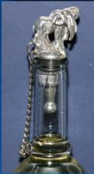
ELEPHANT WS 010