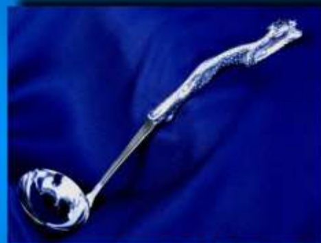
LEOPARD SOUP LADLE SL 002