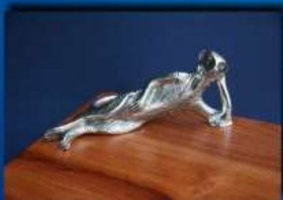
MEERKAT CHEESE BOARD BOD 010