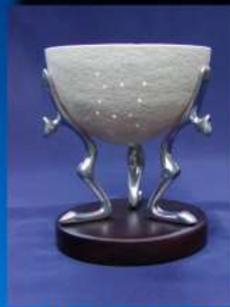
STARGAZERS TEA LIGHT CH 007