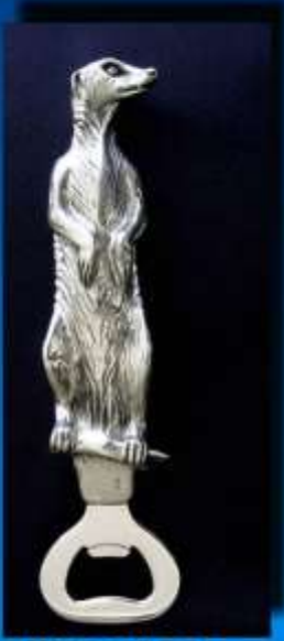
MEERCAT BO 002