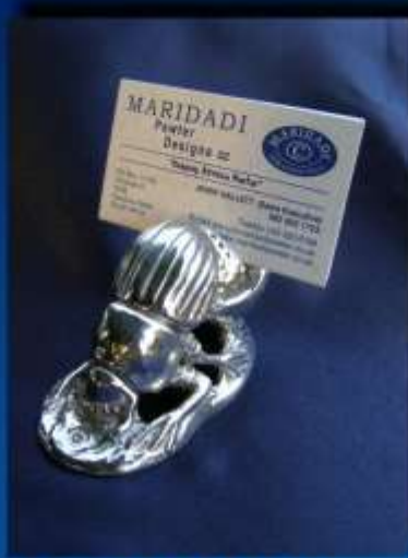
DUNG BEETLE BCH 001