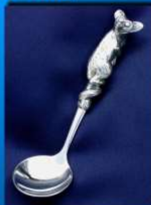
BUSHBABY SUGAR LADLE S 003