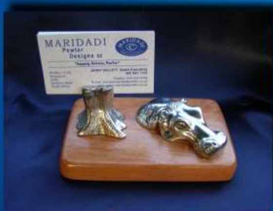
HIPPO BCH 003