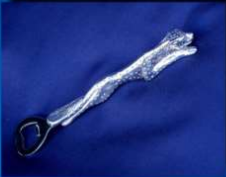
LEOPARD BO 003