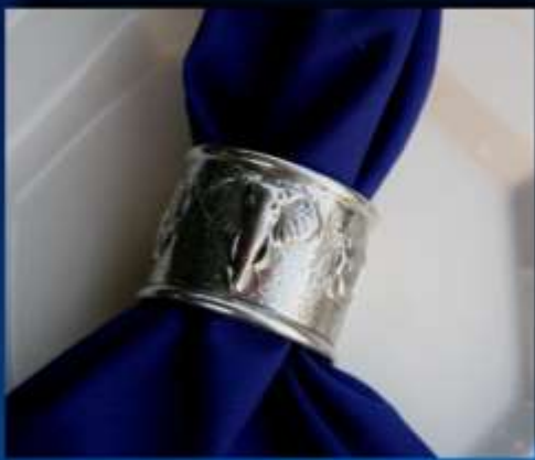
BIG 5 NR 006