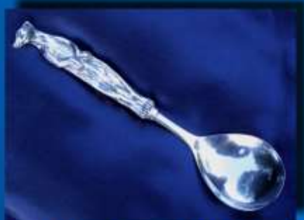
MEERKAT SERVING SPOON SP 004