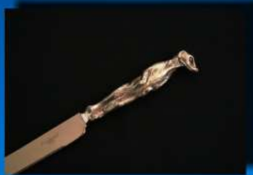
MEERKAT BREAD KNIFE BK 003