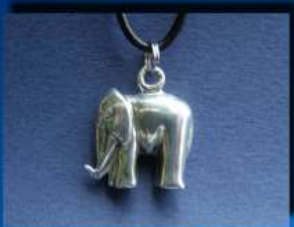
ELEPHANT PENDANT NE 001