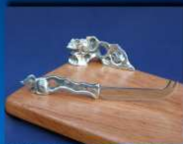
MOUSE CHEESE BOARD BOD 007