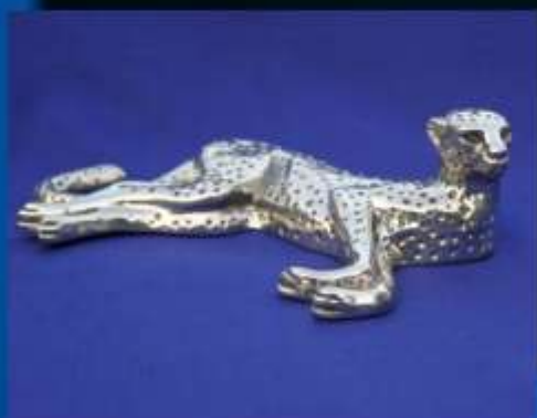
RECLINING CHEETAH PS 001