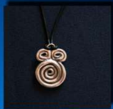
IZULU PENDANT NE 002