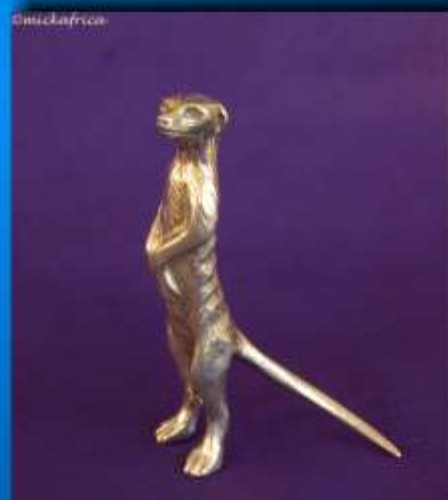
TEENAGER MEERCAT MS 004