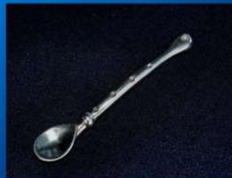
DINKY CONDIMENT SPOON ZR 010