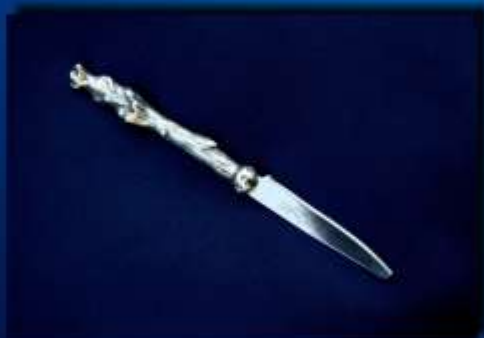
MEERKAT FRUIT KNIFE FRK001