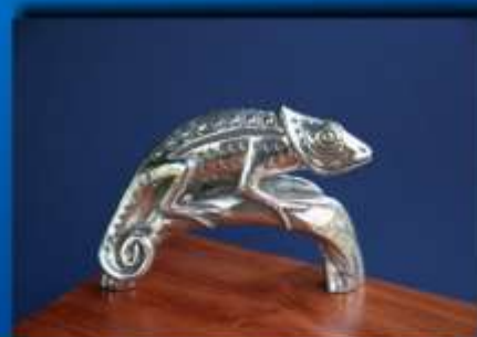
CHAMELEON CHEESE BOARD BOD 011