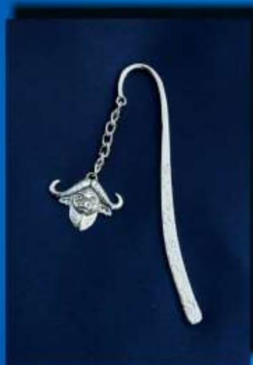
BUFFALO BOOKMARKER BMH 003