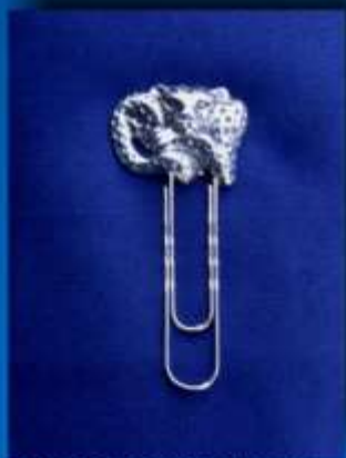
LEOPARD BOOK MARKER BM 001