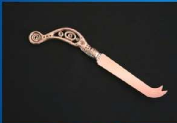
CHEESE KNIFE ZR 007