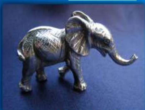
BABY ELEPHANT ES 003