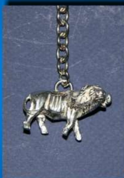
BUFALO KR 003