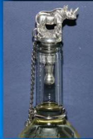
RHINO WS 011