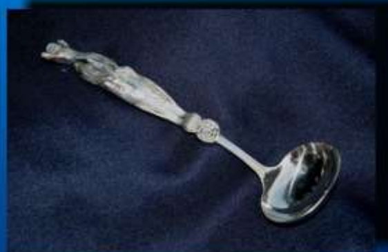
MEERKAT SGL 002