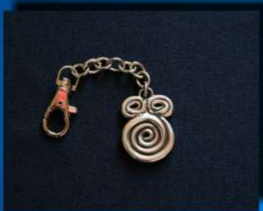
KEY RING ZR 002