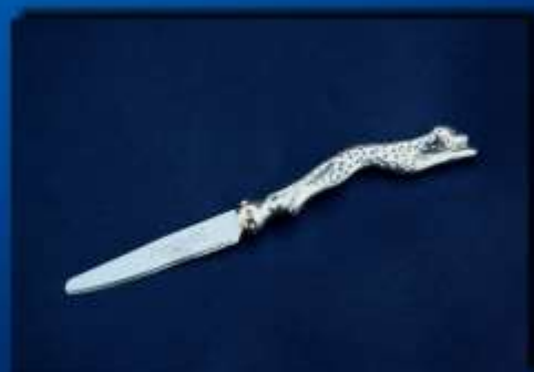
LEOPARD FRUIT KNIFE FRK002